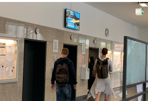
Social Sciences – Bockenheimer Campus

Communication displayed on the screen at the university library is aimed at economics and law students as well as library visitors. The screen is located right at the library entrance/exit.