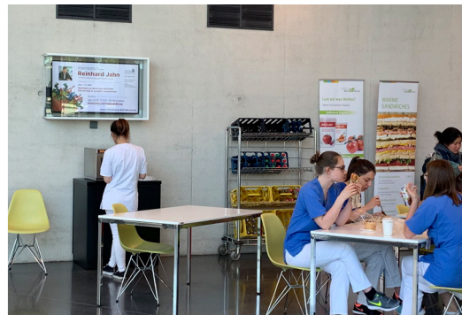
University Clinic – Niederrad Campus

Faculties dispose with dedicated displays showing information oriented towards students and staff relative to the department as well as information for visitors, and in some cases – on-campus events.