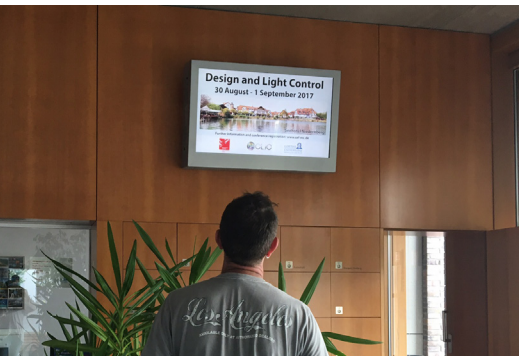
Physics Department – Riedberg Campus

The Goethe University Frankfurt spans five campuses dotted in and around the city of Frankfurt. All 16 university faculties ranging from Law to Physics, as well as the university clinic, sports center, post office, and cafeterias, benefit from SpinetiX digital-signage technology.