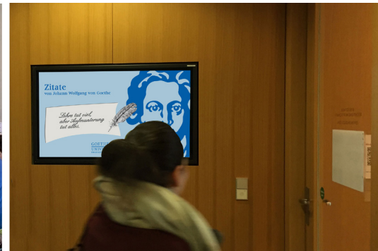
Library – Westend Campus

The university clinic benefits from multiple screens located at the reception and throughout waiting and staff-breaking areas. On-display content varies between health advice, as well as information for students and staff.