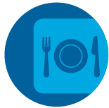
CAFETERIA / MULTI-PURPOSE ROOM