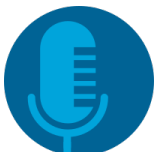
SOUND REINFORCEMENT / TESTIMONY CAPTURE